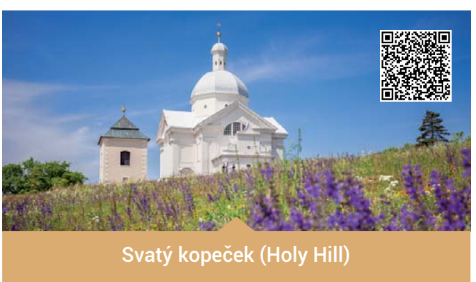
Svatý kopeček (Holy Hill)

📍 Kozí hrádek 11 📞 731 484 500 @ info@zidovskyhribitovmikulov.cz 🌐 www.zidovskyhribitovmikulov.cz 📅 April, May Fri–Sun: 10–16; June Tue–Sun: 10–17; July–September Mon–Sun: 10–18; October Sat–Sun: 10–16 📱 full 40 CZK, concessions 25 CZK (children, students, seniors)