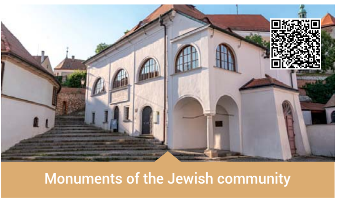
Monuments of the Jewish community