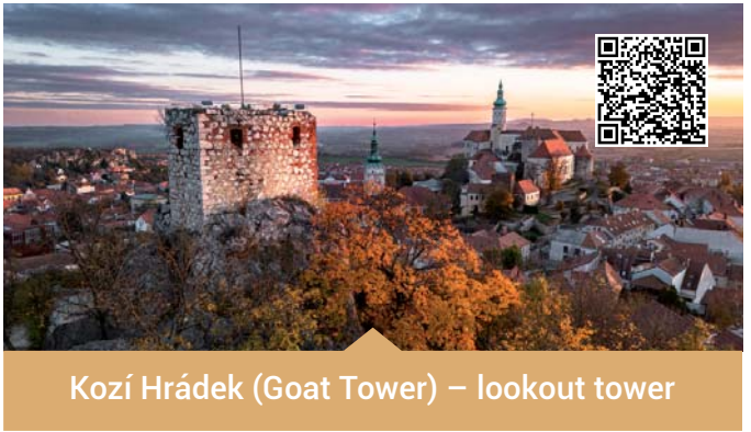
Kozí Hrádek (Goat Tower) – lookout tower

The chapel is a copy of the original Holy Sepulchre in Jerusalem where Jesus was interred following his crucifixion. A statue of the dead Jesus Christ is located in a small back room.