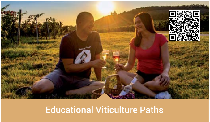
Educational Viticulture Paths