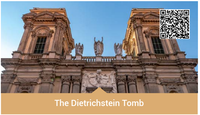
The Dietrichstein Tomb

The historical centre of the town is part of the urban conservation area. The most important buildings in the square include "U Rytířů" (The Knights' House) with its Renaissance sgraffito with biblical and ancient scenes, the canons' houses, the Statue of the Most Holy Trinity, also known as the Plague Column, and the fountain dating to the eighteenth century with a statue of Pomona.