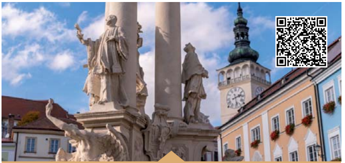
The Historical Square

The Chateau Garden was established by Cardinal Franz von Dietrichstein during the magnificent conversion of the Renaissance castle into a representative chateau (1624). The current composition of the garden represents a return to the original Italian Baroque garden.