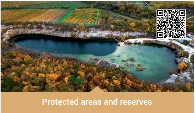
Protected areas and reserves

You can find out more about the route in Mikulov region at: https://www.jakubskacesta.cz/svatojakubska-cesta-na-jizni-morave/z-brna-na-jih .