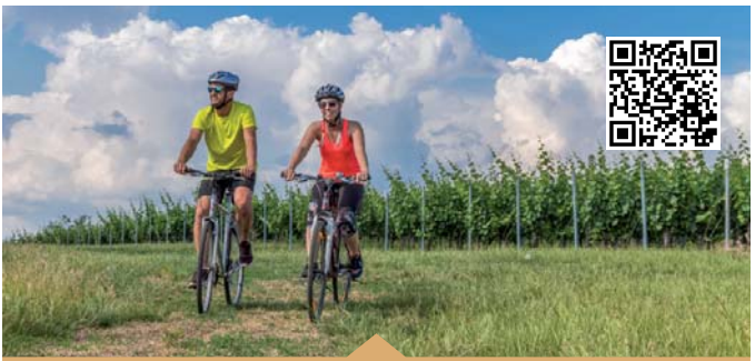
Cycling routes in Mikulov and the surrounding area