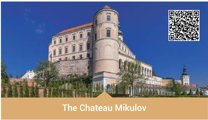
The Chateau Mikulov

The former Liechtenstein and later Dietrichstein chateau has been the unmistakable dominant landmark of Mikulov for a number of centuries. The most interesting parts of the Baroque chateau include the chateau library and the Ancestors' Hall. You can also find a great many interesting permanent exhibitions here.